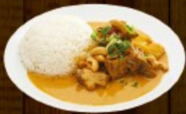
Beef Massaman Curry With Rice