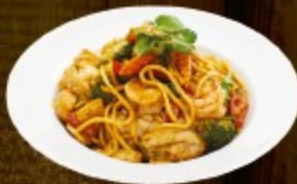
Seafood Pad Tum Yum Talay [HOT]