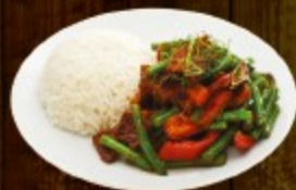
Prik Khing Pork