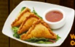
Vegetable Spring Roll