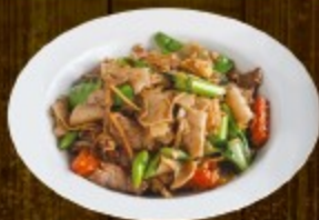
Beef Pad Se Ew