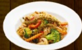
Chicken Pad Se Ew