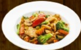
Pork Lime Leaf With Thin Rice Noodle (800)