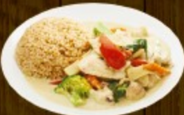
Chicken Green Curry