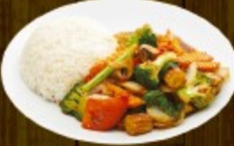
Vegetable chili basil with Rice (800)