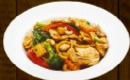
Chicken Cashew Nut Sauce with Hokkaido Noodle