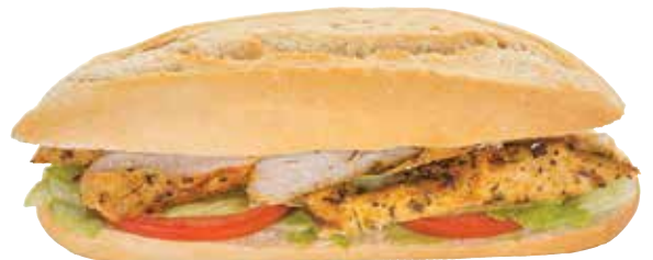
Sliced Tandoori breast fillet