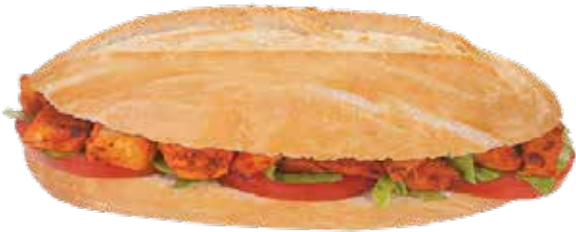
Pulled Roast chicken