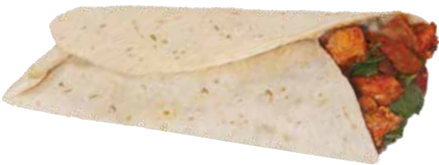
Pulled Roast chicken