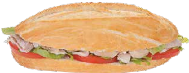
Pulled Cajun chicken