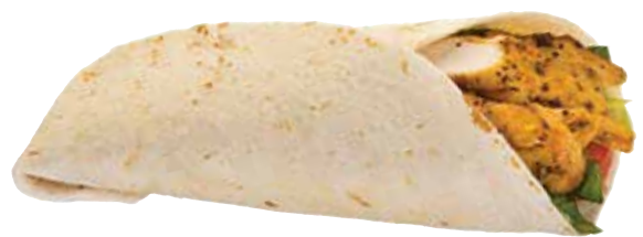
Sliced Tandoori breast fillet