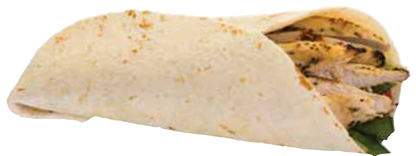
Sliced Cajun breast fillet