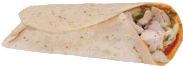
Pulled Cajun chicken