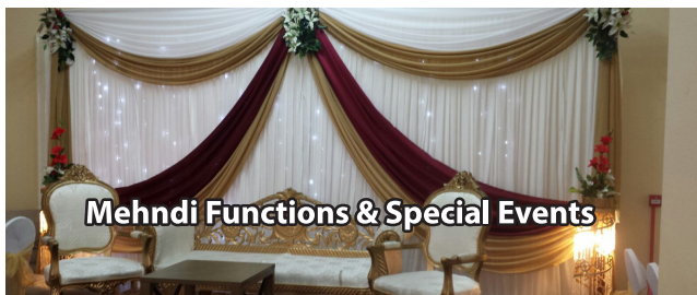
Mehndi Functions & Special Events